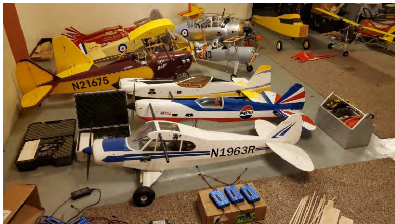
Three favorites charged and ready to go, full of hope (4-6-19)