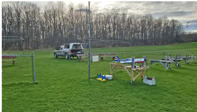
A pretty light turnout for a warm, calm Thursday evening. All three of us (me, myself and I) 4-25-19