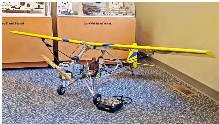
My new ultralight. Can't wait to fly this one!... 😊