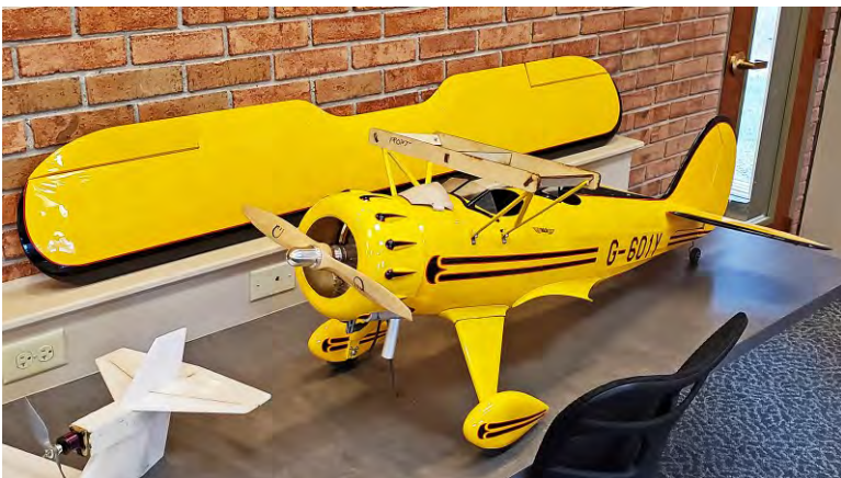
Glenn's new WACO biplane. Should be very easy to see this one in the air. Another great looking plane