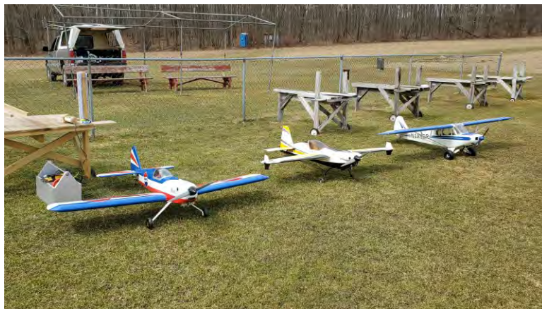
First day out (4-7-19). Six hours of Heaven after a long winter