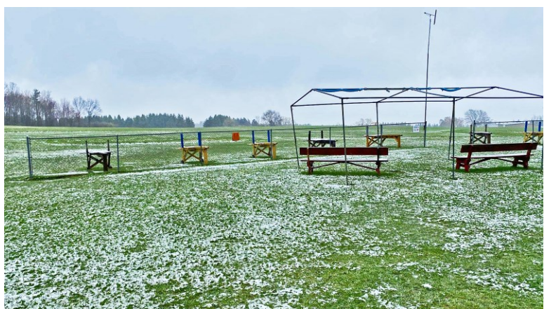
April 16 th . Do we dare to dream of sunny and 70 yet?