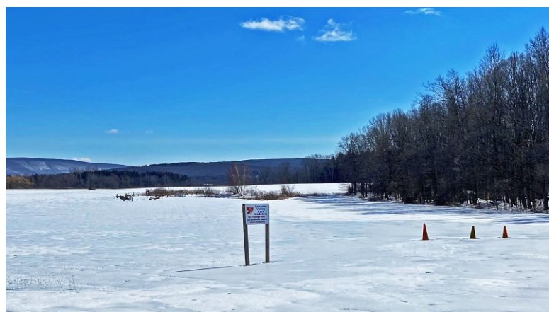
February 25 th . Not much flying was done that day