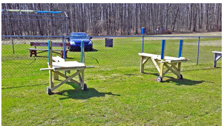
They look even better in their natural habitat