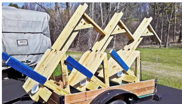
Many well-deserved thanks to Max and Jim for building more stands to replace three of the “seen better days” classics